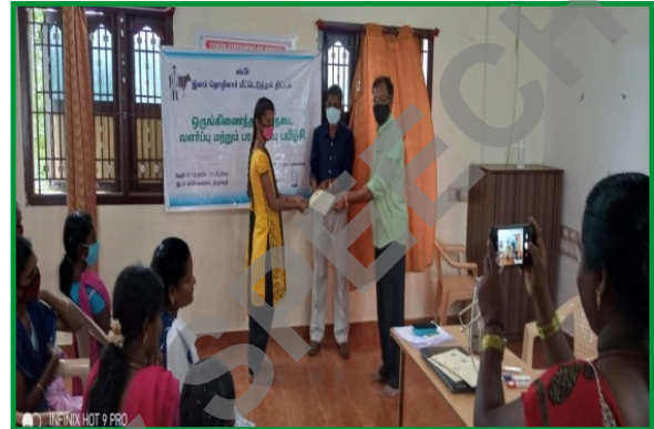
Barefoot veterinarian training to survivors