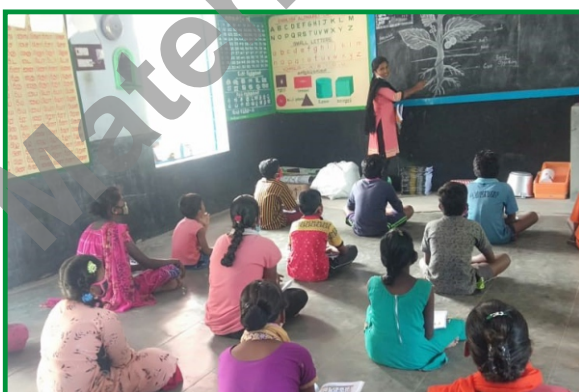
Community resource centre activities