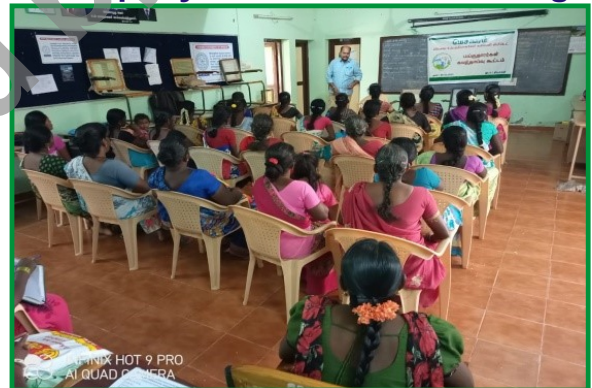
Meshavaram Agricultural Producer Company Shareholders Meeting