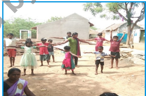
CLC Centre children Extra-curricular Activities