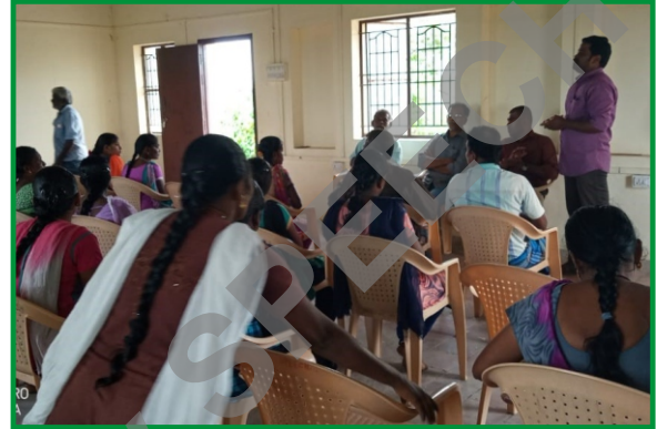
Higher Education Assistance College students